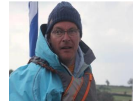
Yvonne Support Crew

I spend a lot of time with my head in the bottom of the boat giving out boat bags and watching the racing.