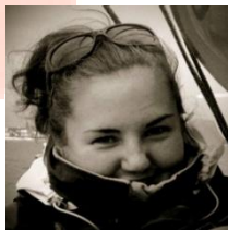
Tessa Child Welfare